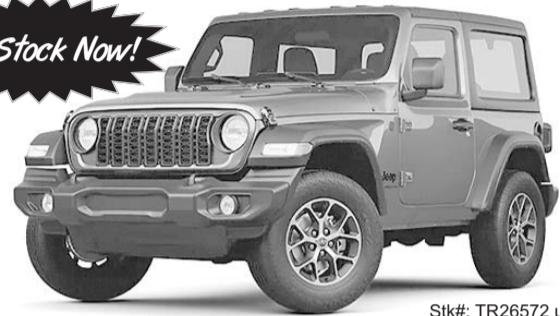
Stk#: TR26572 used in example