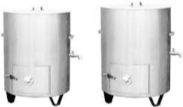
#2530 & #2540 Round Canners