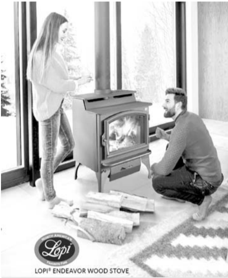
LOPI® ENDEAVOR WOOD STOVE