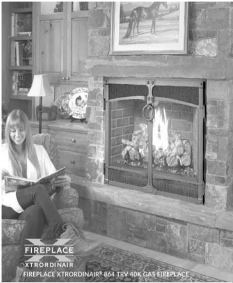
FIREPLACE XTORDINAIR® 864 TRV 40K GAS FIREPLACE