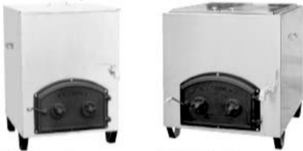
#2437 Square Canner