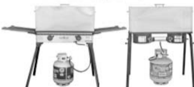
Shown with 60,000 BTU #PRO60X (Left) & #EX60LW (Right)