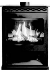
The Dawn Series Burns LP or Natural Gas